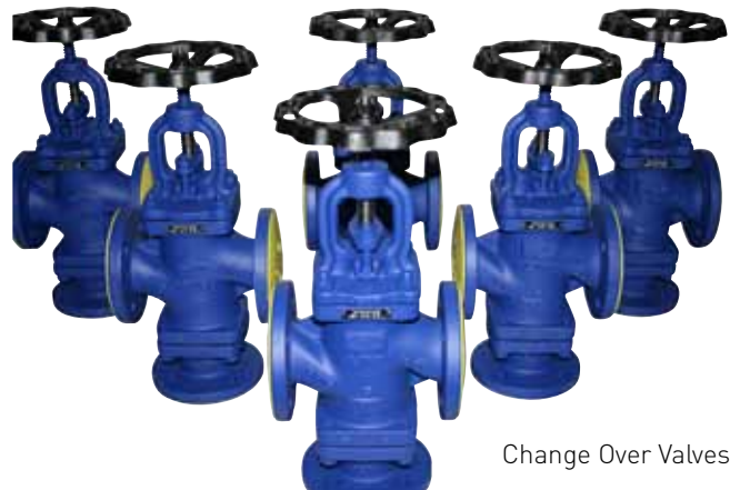
Change Over Valves