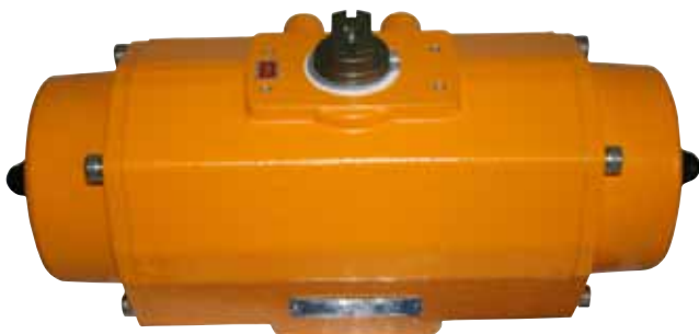
Actuators (Air or Hydraulical Driven)