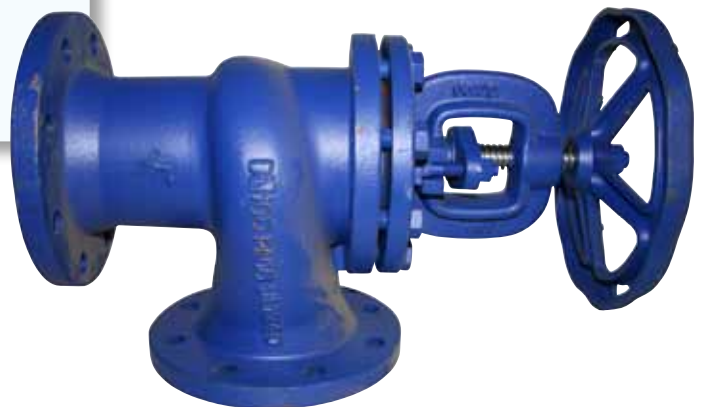
Flanged Angle Valves