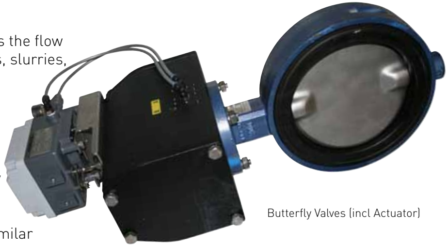
Butterfly Valves (incl Actuator)

A butterfly valve is a type of flow control device, typically used to regulate a fluid flowing through a section of pipe. The valve is similar in operation to a ball valve. A plate or disc is positioned in the center of the pipe. The disc has a rod passing through it that is connected to an actuator on the outside of the valve. Rotating the actuator turns the disc either parallel or perpendicular to the flow. Unlike a ball valve, the disc is always present within the flow, therefore a pressure drop is always induced in the flow, regardless of valve position.