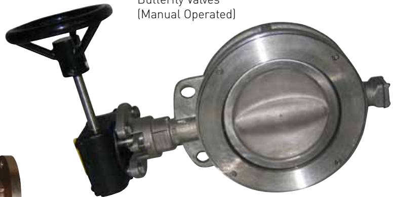
Butterfly Valves (Manual Operated)