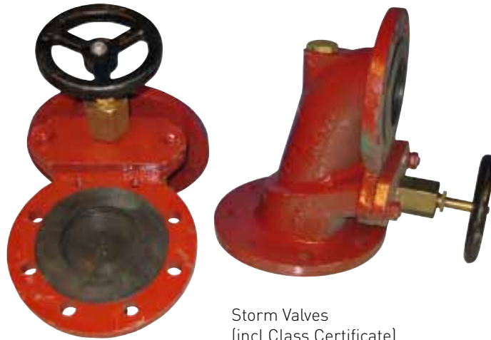
Storm Valves (incl Class Certificate)