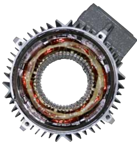
Stator of E-Motor

What type of e-motors does TSS Rotterdam supply?