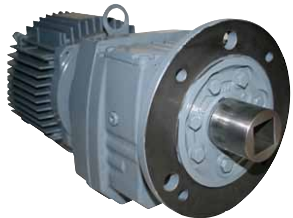
E-Motor Reductor (With Hollow Square Shaft)