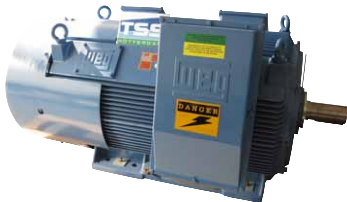
High Voltage Induction E-Motor