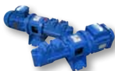
Pumps (Positive Displacement)