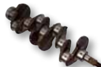
Diesel Engines (Spare Parts)