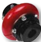
Couplings & Inserts